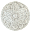
Dusty Clear HSS 8-005 236 ml