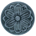
Moonglow HSS 8-115 236 ml