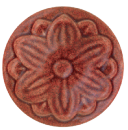
Venetian red HSS 8-113 236 ml