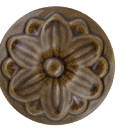
XO Brown HSS 8-110 236 ml